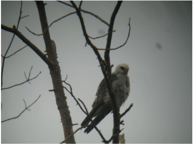
Mississippi Kite Hatfield, Montgomery Co., PA 6-13-14.jpg